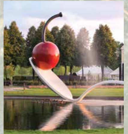
Minneapolis Sculpture Garden**