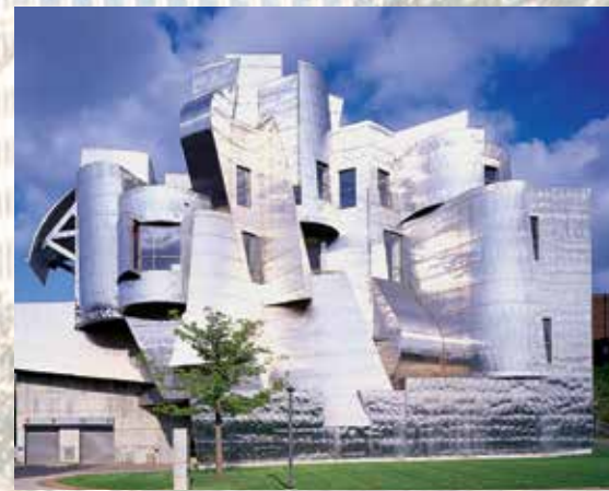
Weisman Art Museum*

4:15 p.m. – Depart for W Foshay Minneapolis Hotel