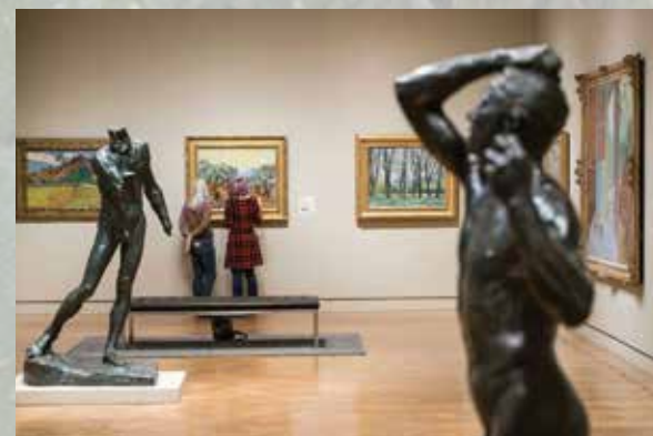
Minneapolis Institute of Art